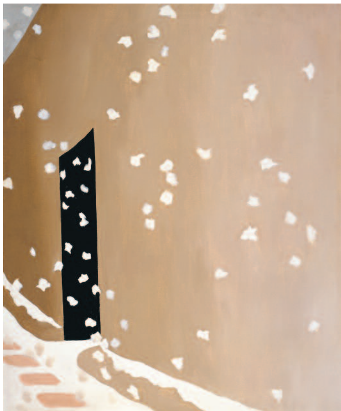
ABOVE: Georgia O'Keeffe, Black Door with Snow , 1955. Oil on canvas, 36 x 30 in. Private collection.

Georgia O'Keeffe Home and Studio P.O. Box 40, Abiquiu, New Mexico 87510 FAX 505.685.4551